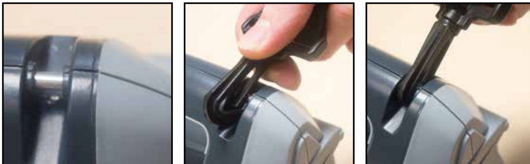
Fig 2. Fitting

Supplied with a high quality adjustable shoulder strap. Making it comfortable to carry the Searchlight, whilst keeping your hands free to perform other tasks. See Fig 2. below showing fitting and removing the straps.